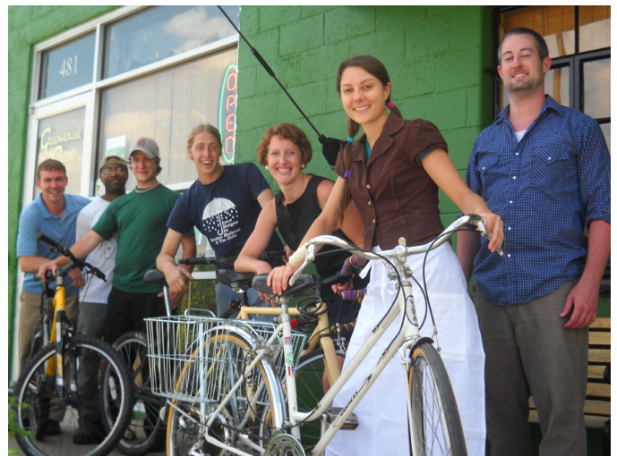
Some of the Greenhouse Grille crew.

First place winners include National Center for Appropriate Technology, Greenhouse Grille, and Garver Engineering. Greenhouse Grille turned in the highest overall percentage of cyclists with over 50% of their workforce cycling on Thursday, May 20 th